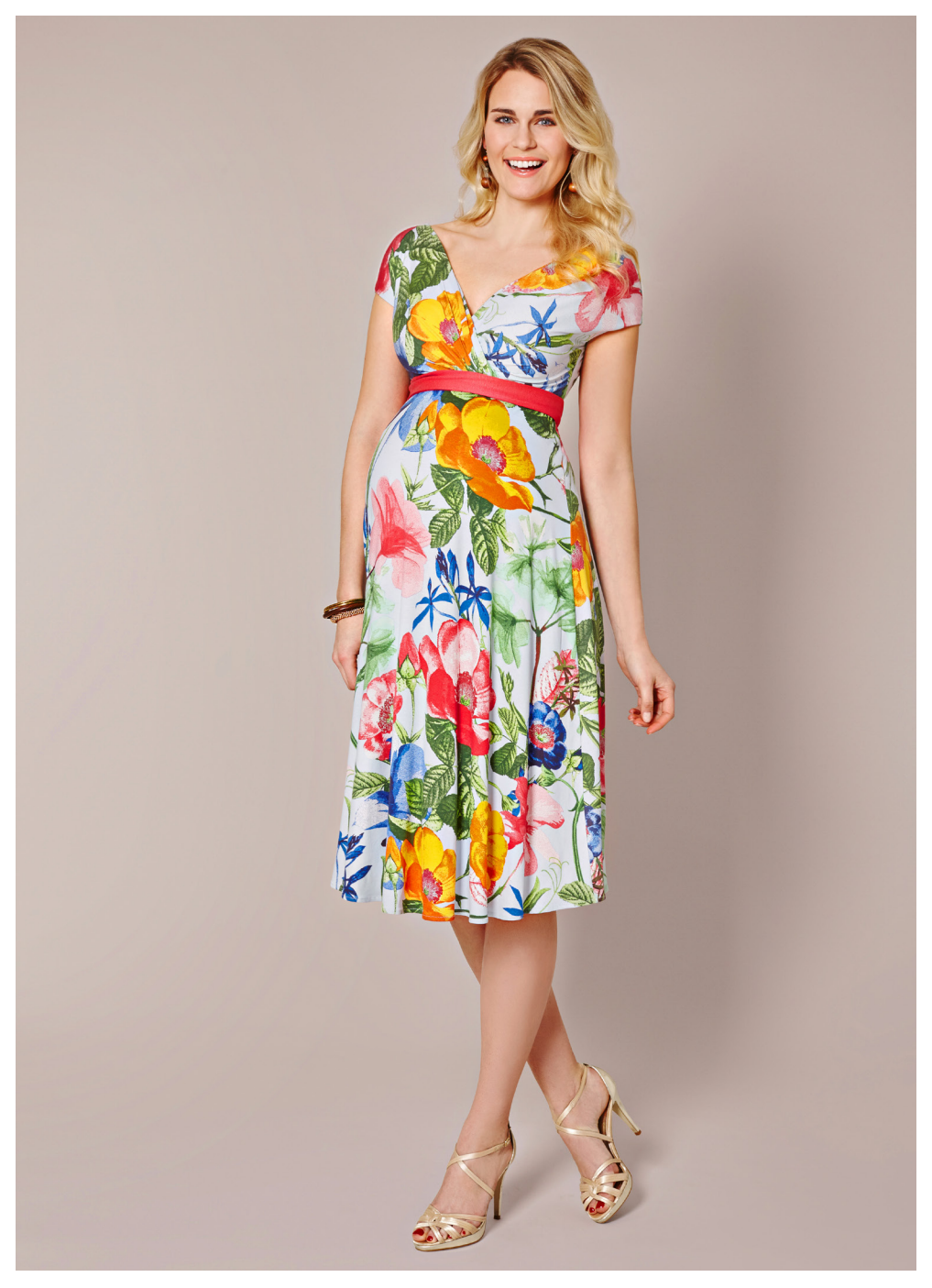
• HAWAIIAN BREEZE DRESS \sim \$180 •