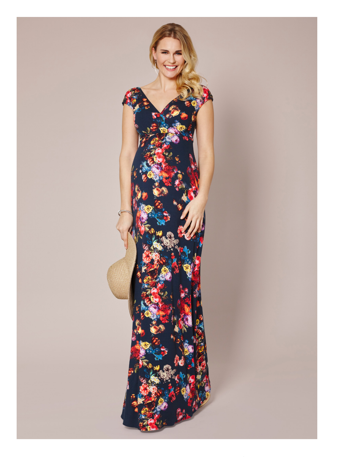
\cdot Floral maxi dress midnight garden \sim \$205 \cdot