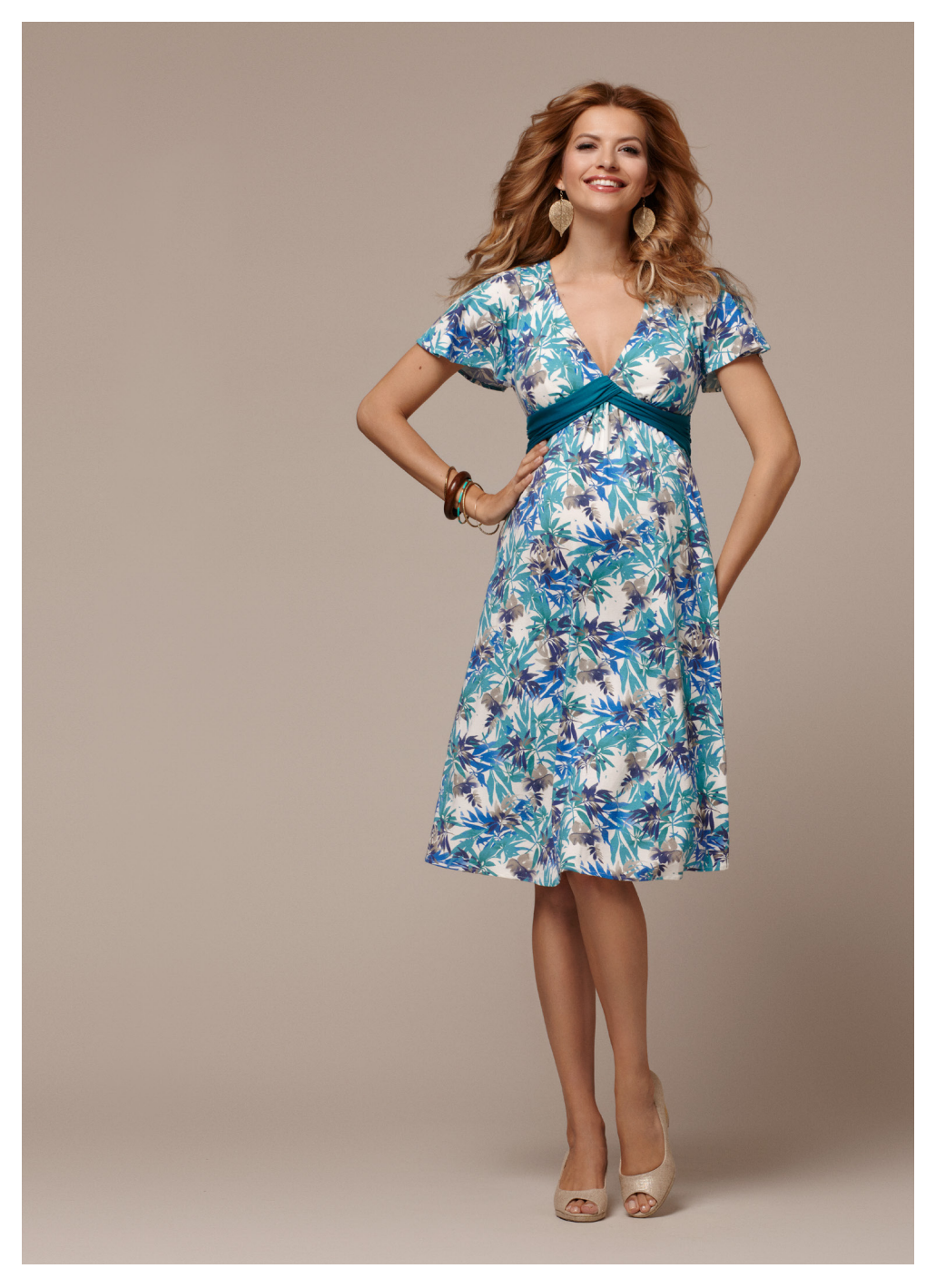
\cdot LIZZY DRESS BLUE NILE \sim \$215 \cdot