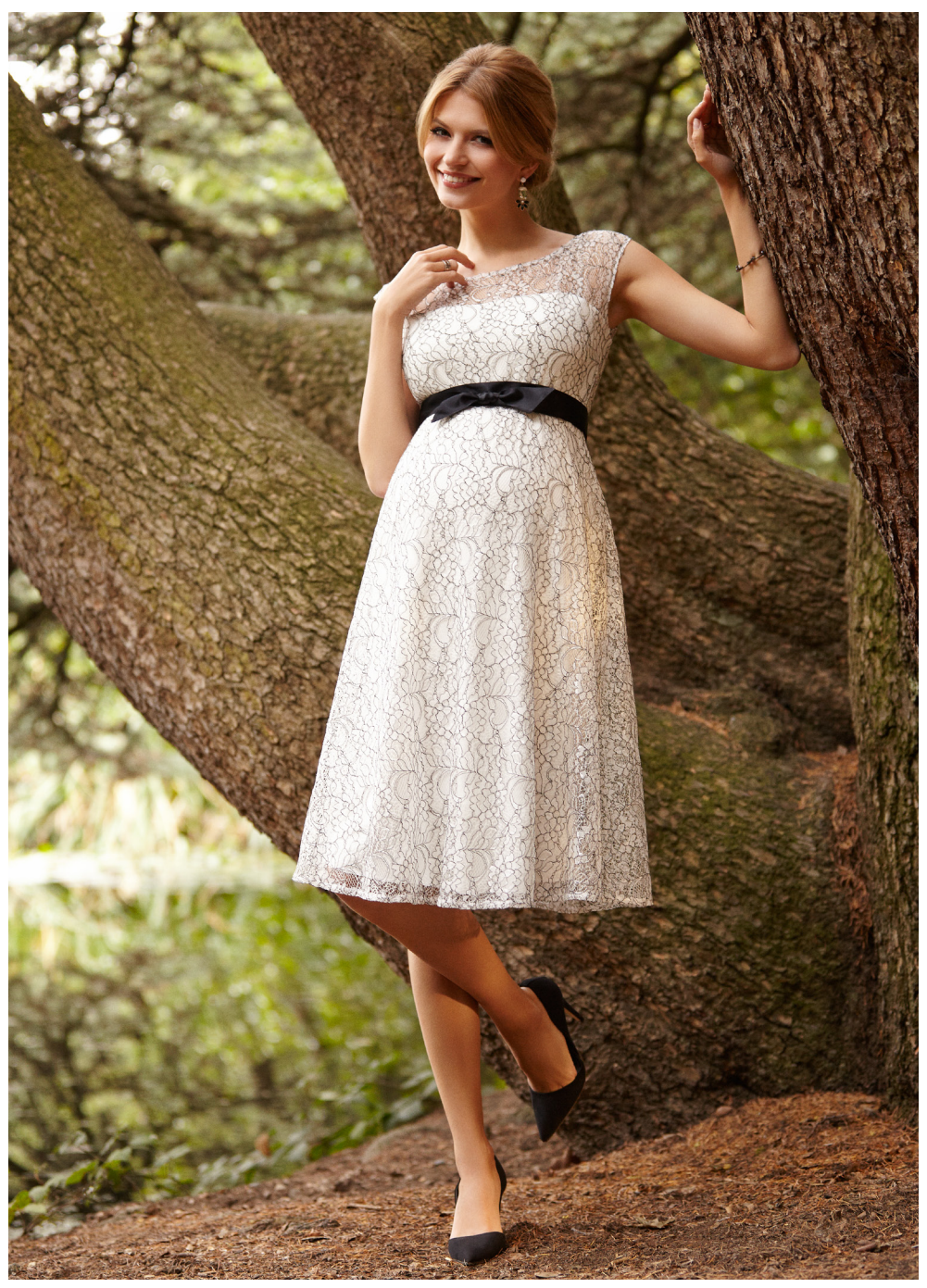
\cdot Daisy dress mono lace \sim \$270 \cdot