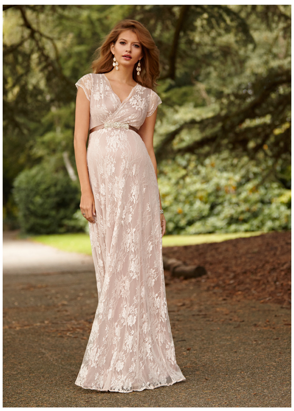
\cdot EDEN GOWN BLUSH \sim \$450 \cdot