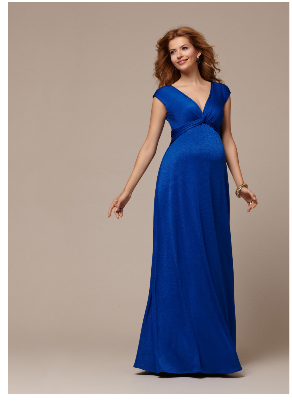
\cdot Clara gown cobalt blue \sim \$360 \cdot