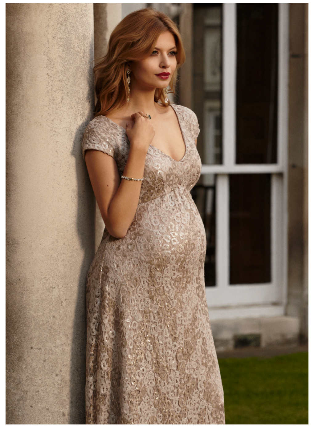
\cdot Carmen gown gold rush \sim \$525 \cdot